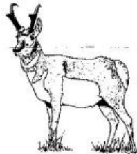
Pronghorn Antelope - small tan-and-white animal with black horns.