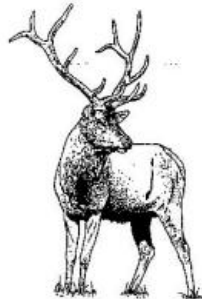
Elk - very large, dark brown with light tan rump and small tail.