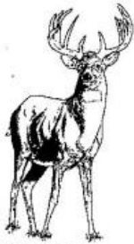
Whitetail Deer - brown tail is "flagged" (raised) when deer runs.